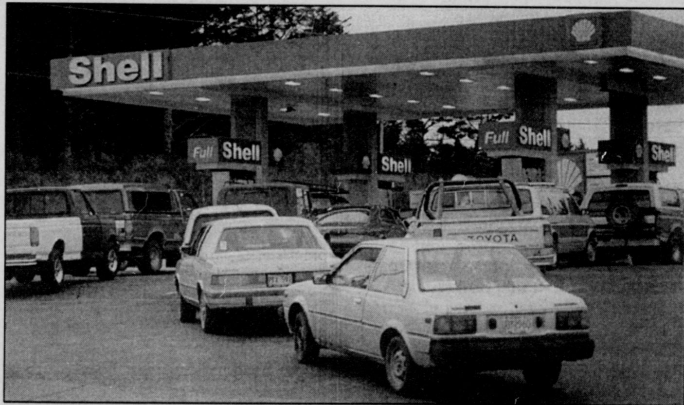
Photo top right: Shelley Upchurch pushes the soft drinks (or is that weightlifting?). Photo above: The Shell station at the north end of Lincoln City.

The Marketing and Winner's Circle staff arrived at both the north and south Garrison Shell stations in Lincoln City at 6 a.m. in anticipation of the crowd they knew would be hot on their heels. Chinook Winds staff worked alongside the gas station attendants, pumping gas, washing windows, answering questions, making change, passing out soft drinks, and running, running, running. Staff from two radio stations did live remotes and a reporter from the local newspaper took photos. A natural or "unnatural" high was easy to come by with the volume of gas fumes in the chilly morning air.