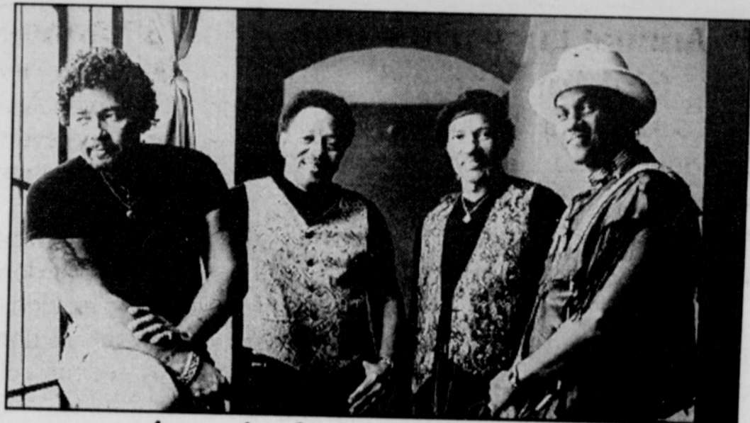
Aaron, Art, Charles, and Cyril Neville