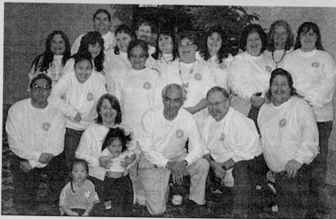
Top photo: The “gang.”