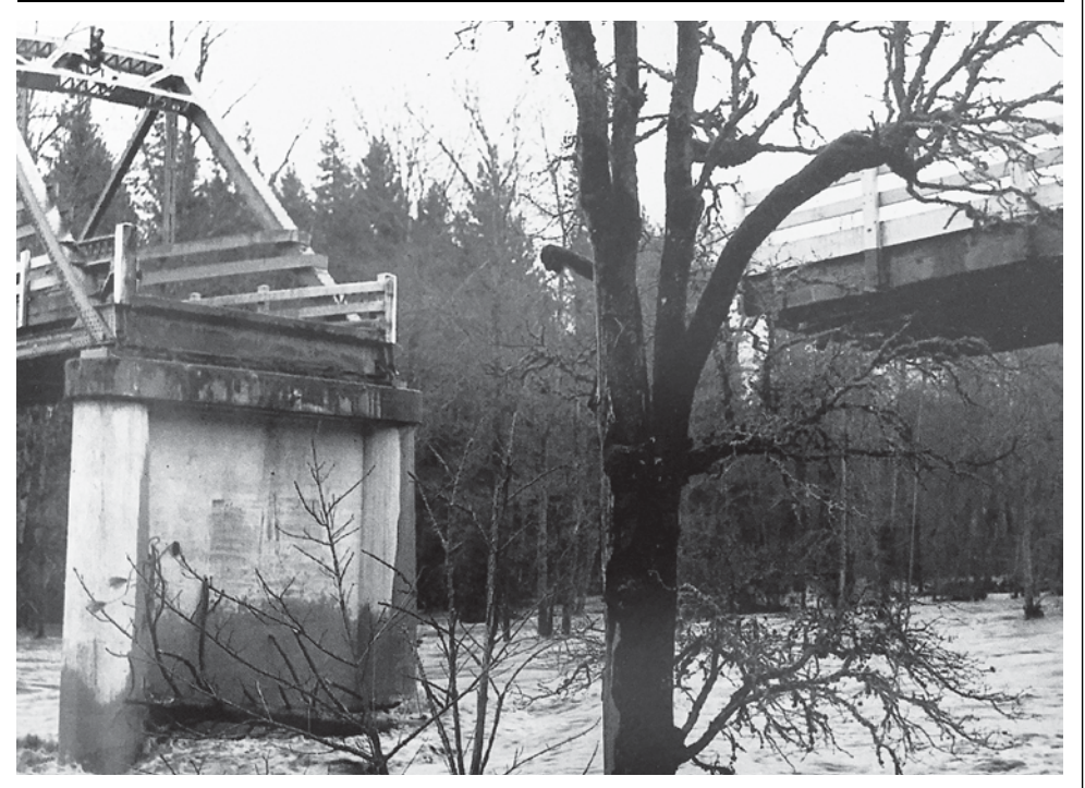
Flood-damaged Applegate Bridge in December 1955, near the mouth of Slate Creek.