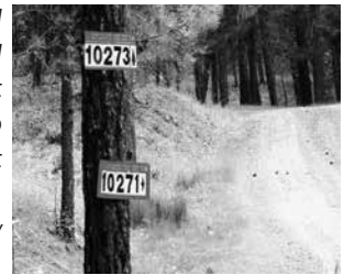
Additional directional signs direct visitors to the correct address.

suggests cleaning your home’s gutters as soon as possible this spring. He then suggests doing this again on a dry day later this upcoming winter. After that, you won’t have to clean the gutters again until next winter! Much more comfortable than getting up on a ladder in the summer heat!