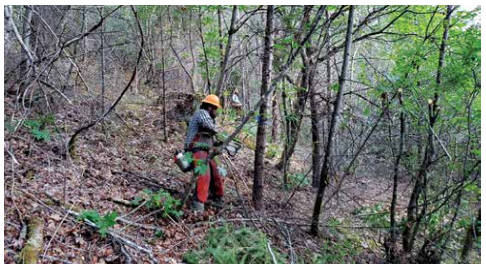
A Lomakatsi crew member thins brush and smaller diameter trees, setting the stage for reintroducing low-intensity prescribed fire as part of the Upper Applegate Watershed project.