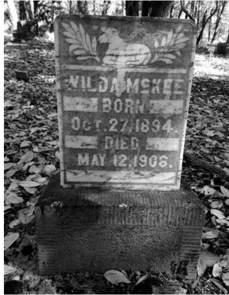
A gentle lamb watches over Wilda, daughter of Deb and Leila McKee, in the Logtown Cemetery, where volunteers have cleaned markers.

While MBHS can't host "close-up" activities like last year's—we won't be decorating cookies, caroling, or enjoying the third-grade orchestra from ROCS—we will open the museum trailer with many new items on display and sell a new line of MBHS T-shirts sporting classy logos by local artist Whit Whitney and other nice merchandise to complete your holiday shopping. Unisex and women's style tees are just $12 ($15 for XXL), youth sizes $10. Plus we'll have special illuminated