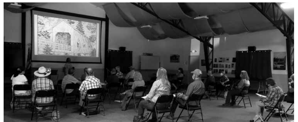
Applegate Fire District provided a safe location for the socially distanced MBHS annual meeting.