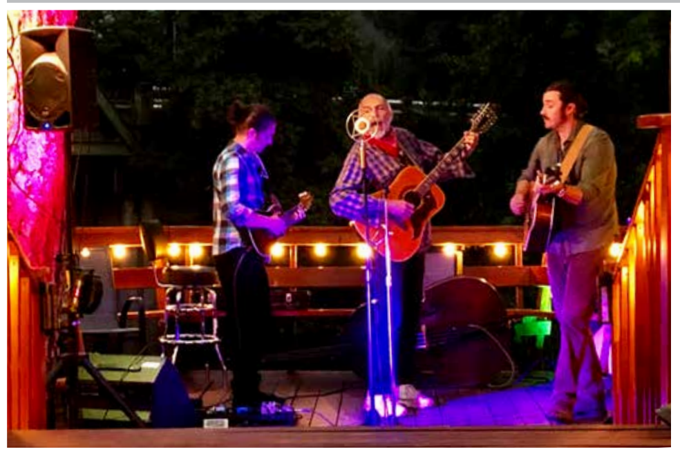
The Applegate String Band strumming it up at the Almeda Fund Raiser.