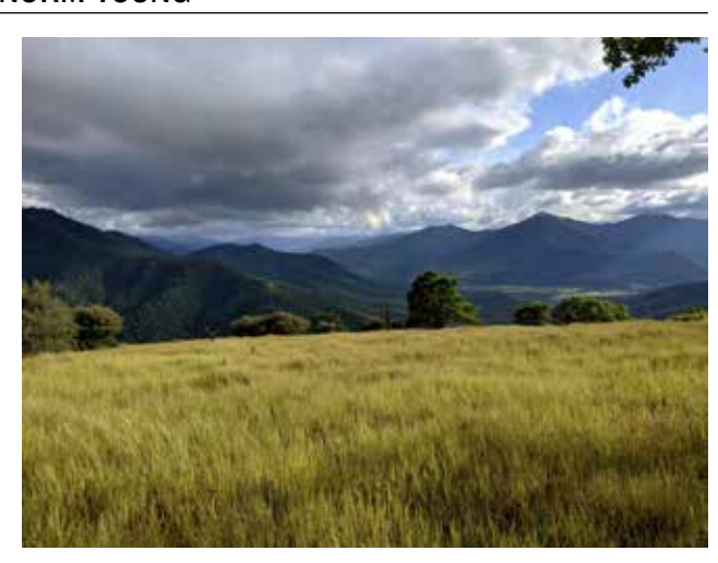
One of many striking views from the East Applegate Ridge Trail. The full ART is envisioned to run from south of Jacksonville all the way to Grants Pass.

The current ATA board is energized (although we need more of us!) and working to maintain and improve the amenities for the East ART. We are working with the BLM to move the second major section of the ART forward. The 13-mile Center ART will start from Highway 238, at the East ART trailhead