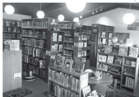
The Williams branch library.