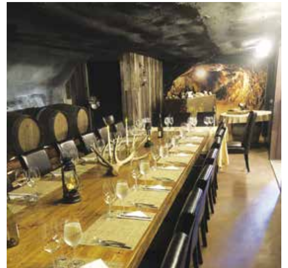
Augustino wine mine.

mailing list for special events, wine club offerings, and tasting-room hours.