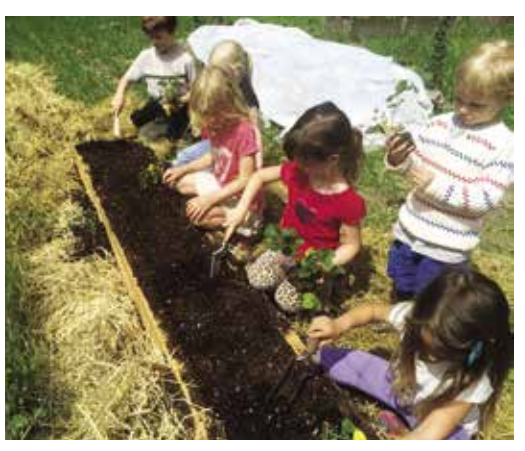
The SCA garden is tended by children who attend the Forever Flowering Kindergarten there.

The Sugarloaf Resource Center, an all-ages space for culture and learning, welcomes public visitors to SCA land on Mondays and Thursdays from 3:30 -6:30 pm and Sundays from 1:30 - 6:30 pm. The resource center provides a cozy environment for self-directed and social learning and hosts a collection of