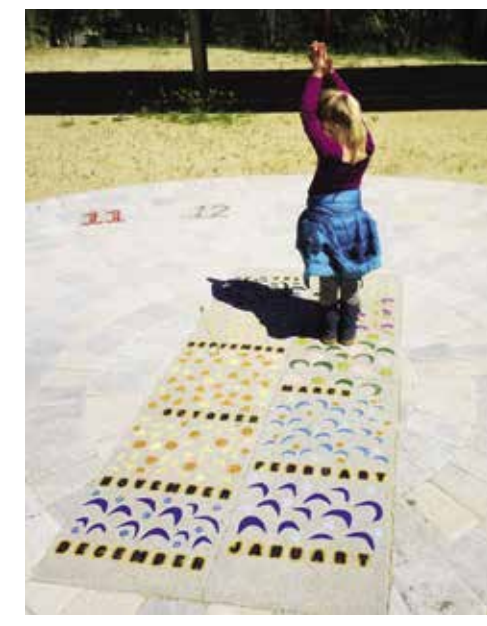
Young girl trying out the newly installed interactive sundial in Cantrall Buckley Park.

I want to thank you for all the wonderful compliments about the new features in the park-the art sculptures, the new plantings-and how good the park looks in general. It is a wonderful example of the partnership of our community's generous donors and willing volunteers working alongside the Jackson County Parks management.