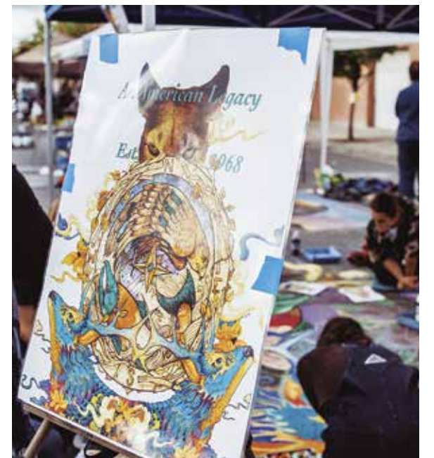
The mural created by HVHS art students at the 2018 Art Along the Rogue celebrated 50 years of the Wild and Scenic Rivers Act, signed into law by President Johnson in 1968.