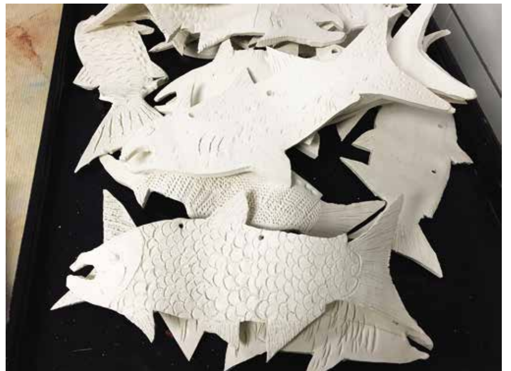
Greenware salmon are awaiting glaze at Ruch School.