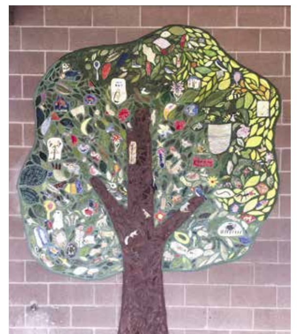
Applegate School students will soon paint tiles to create a river flowing away from their tree mural.