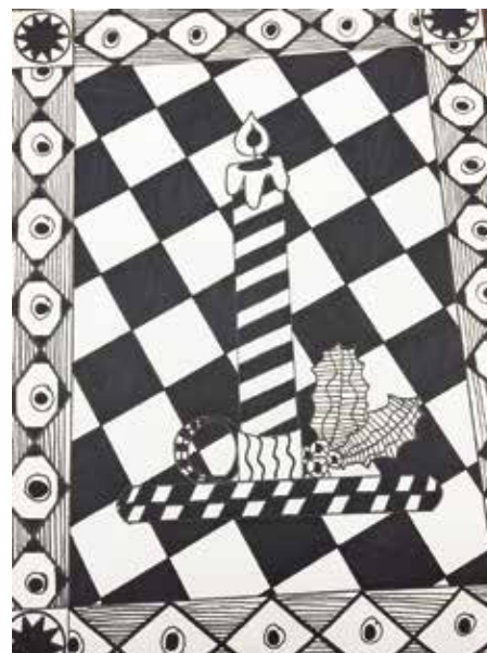
Zentangle candlestick by Caleb Teel, a seventh grader at Lincoln Savage.