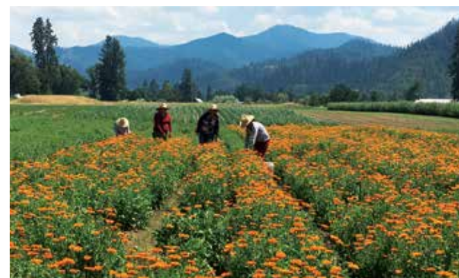
Harvesting calendula at Oshala Farm.