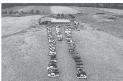
Monthly Wine Down at Plaisance Ranch.