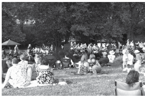
Concerts on the Beach at Red Lily Vineyards.

June 7: Blue Lightning; June 14: Fret Drifters; June 21: TC and the Reactions;