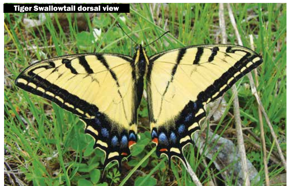
Tiger Swallowtail dorsal view