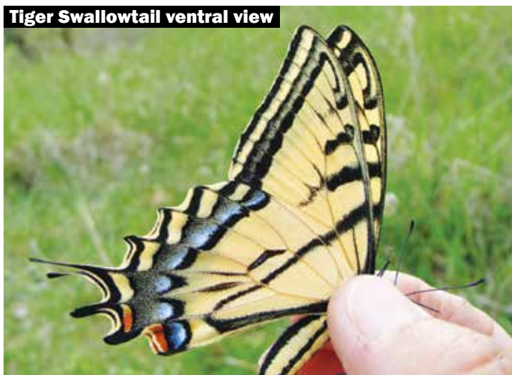
Tiger Swallowtail ventral view

Linda Kappen humbugkapps@hotmail.com