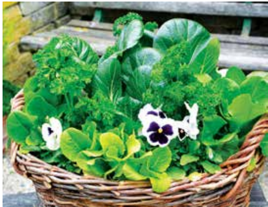
Photo, top left: Ready-made salad in a basket.

Dirty fingernails and all, Sioux Rogers • 541-890-9876 dirtyfingernails@fastmail.fm