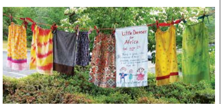
Dresses created out of pillow cases at Ruch Library to send to girls in Malawi, Africa.