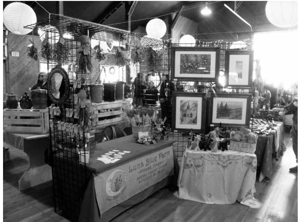
Pacifica's Annual Winter Arts Festival is always full of interesting items from local vendors.