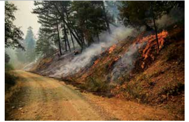
Burnt Peak Fire burning along Kinney Creek Road.

Lightning in mid-August ignited over 30 fires within the Siskiyou Mountains Ranger District. Ongoing fires across the Rogue River-Siskiyou National Forest, including the Chetco Bar Fire and the High Cascades Complex, quickly overwhelmed firefighting resources. Of these 30-plus fires, all but five were quickly contained.