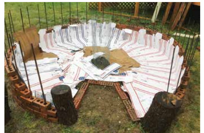
Keyhole gardens in various stages of completion.

Dirty fingernails and all, Sioux Rogers • 541-890-9876 dirtyfingernails@fastmail.fm