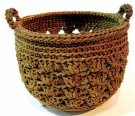
Basket made from hemp.

Hemp is once again legally being grown in specific states. To verify where new legislation is encouraging industrial cannabis, visit this site: ncsl.org/research/agriculture-and-rural-development/state-industrial-hemp-statutes.aspx .