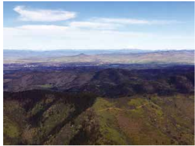
Aerial photo of East ART view.

What's next for the East ART and ATA? First we seek funding to establish an improved trailhead on the west end off Highway 238 near Forest Creek Road. Then we start planning for the Center ART, from Highway 238 to Humbug Creek. This section of trail will access the 7,000-acre Wellington Wildlands, which is comprised of all the public lands between Highway 238, China Gulch, Humbug Creek, and the Forest Creek ridgeline. Even though these public lands look and feel like wilderness, they do not have official