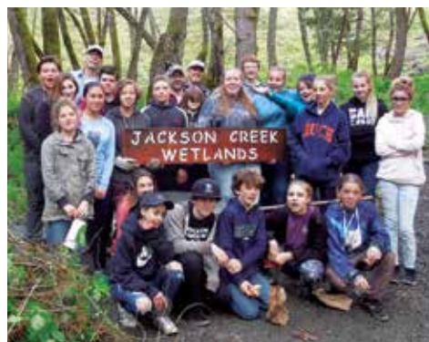
Great crew, and great job done!

“We look forward to regular work and fun visits with your students in the future