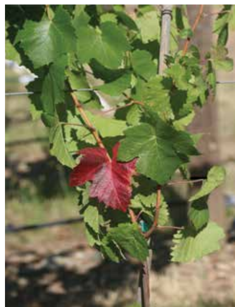
About one week after girdling, the leaf or cane will change color.