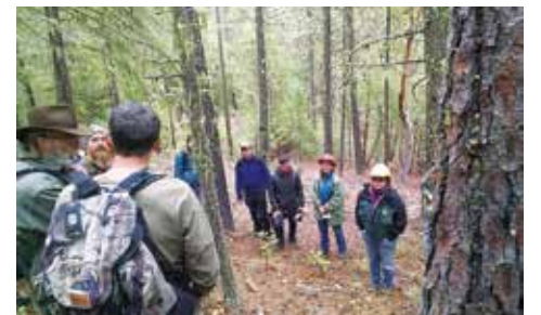
In fall 2016, community members and representatives from the Applegate Neighborhood Network, Applegate Trails Association, US Forest Service, The Nature Conservancy, and Lomakatsi reviewed the project sites and discussed the project's design and objectives.

Working with USFS, Lomakatsi's technicians and inspectors will oversee the