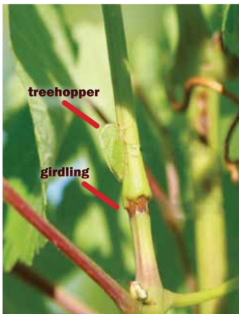
Treehopper adult feeding on cane, causing girdling.