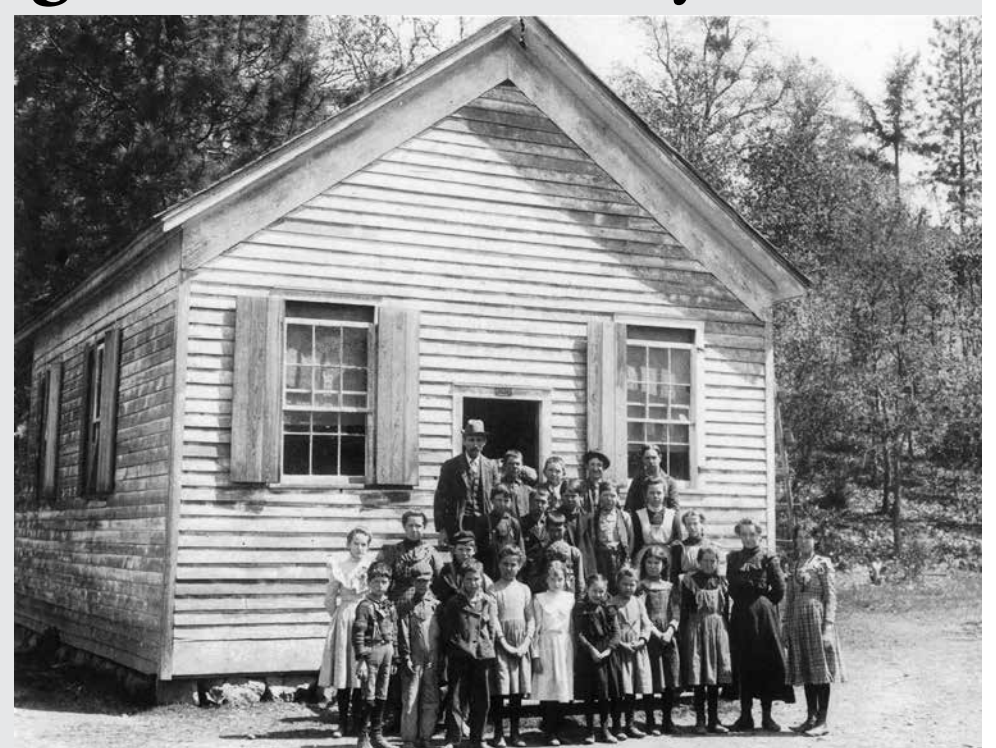
Applegate School, 1902 SOHS Photo #15376