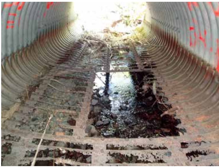
The dilapidated Butcherknife Creek culvert will be replaced with a bridge this summer.

Replacement of the culvert has been a five-year project. The APWC and Oregon Department of Fish and Wildlife fisheries biologists began developing this project in 2013 based on fish passage and habitat needs in the watershed, but the design