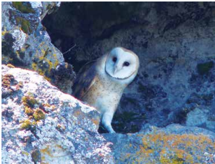
Barn Owl guarding cave entrance.