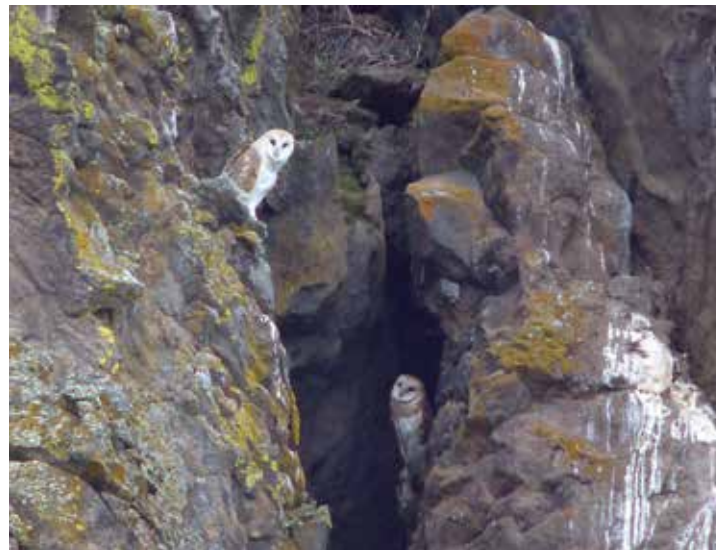
A pair of nesting Barn Owls.