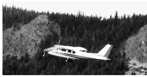
Aerial detection surveys show increases in conifer mortality and killed trees.

In our report on the 2015 mortality increase , in the Spring 2016 Applegater , we described the aerial detection surveys. That article began with a lengthy quote from our previous article on “all those dead trees” in the June 2003 Applegater . The quote ends with “But even after decades of close observation, we can sometimes be a bit surprised by how quickly things change and how large the scale of impacts can be.” In certain areas of the AMA, there was indeed a bit of surprise in 2016.