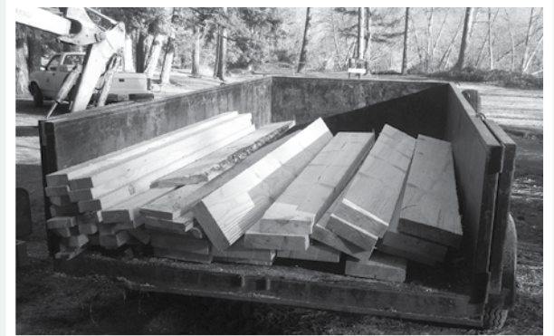
Top photo: Chuck Dahl on his way to the top of a huge ponderosa pine. Bottom photo: Wood from the pine tree is being milled to make new picnic tables.