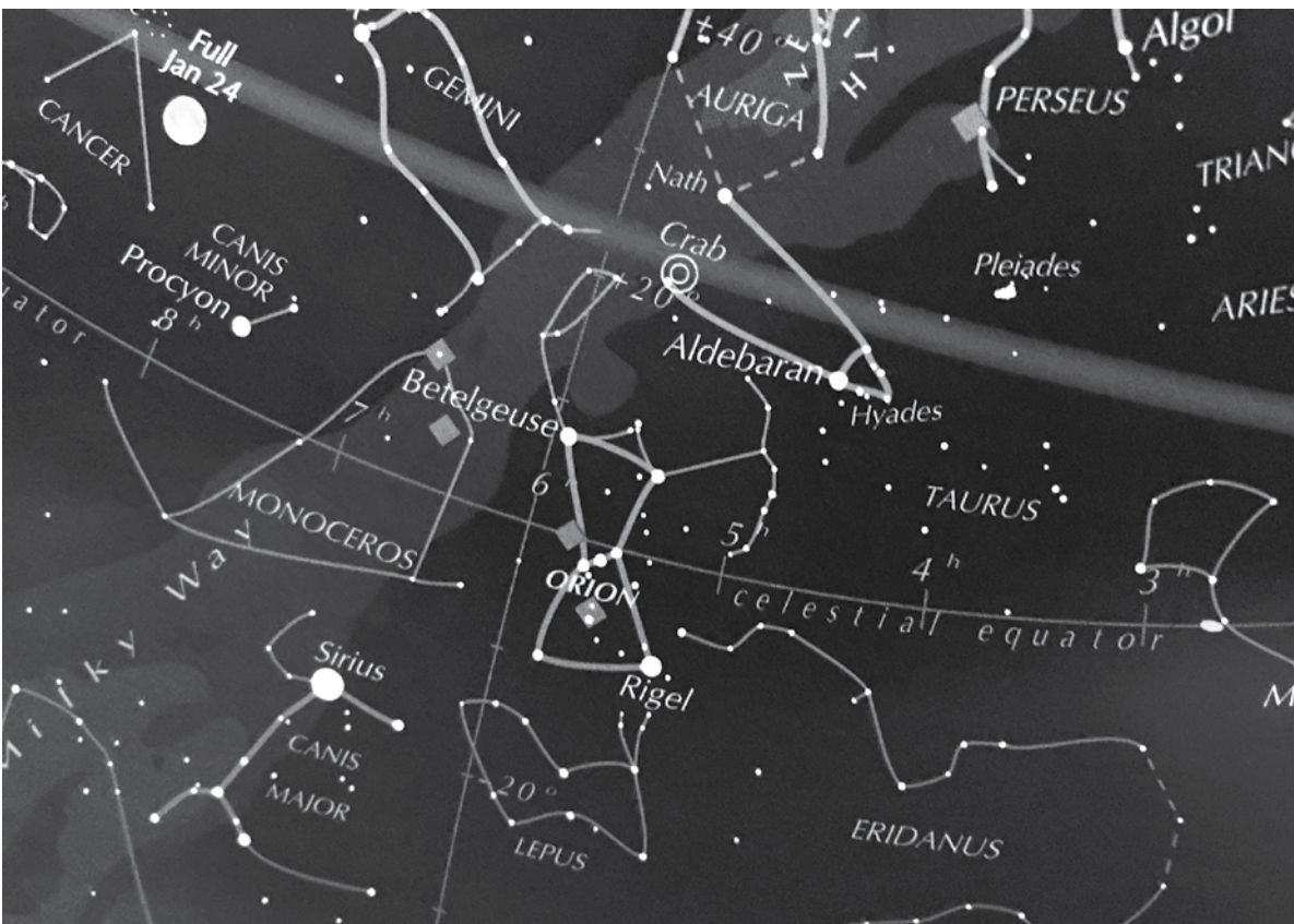
Illustration: Guy Ottewell's Astronomical Calendar 2016.