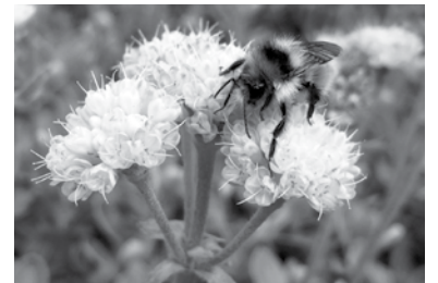
Black-tailed bumble bee foraging on sulphur flower buckwheat.

Klamath-Siskiyou Native Seeds. After a long summer collecting native seeds in the foothills and mountains of the Applegate and beyond, Klamath-Siskiyou Native Seeds has updated its inventory for those seeking locally sourced, wildcrafted native plant seeds. With a focus on flowering native pollinator plants, the motto of Klamath-Siskiyou Native Seeds is "Grow Native, Grow Wild." Online mail-order for packets of native seeds is available, as well as seed-collection contracting for larger amounts of seed. Native plant seeds are used in habitat restoration projects, land stewardship, and gardens of all kinds: pollinator gardens, butterfly gardens, rock gardens, permaculture, food forests, native hedges, ornamental gardens, and more! Support native plant conservation and local, sustainable business in the Applegate Valley. klamathsiskiyou@gmail.com • klamathsiskiyouseeds.com .