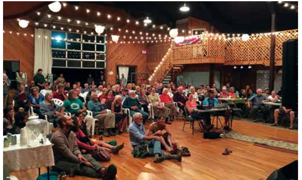
Photo above: A large crowd at Pacifica sits enthralled, watching Walking the Wild Applegate .