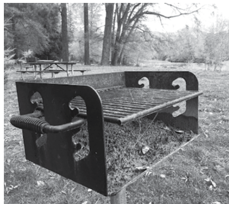
The community-funded, firefighter-installed barbecues have been a wonderful addition to the park. They were well used this summer and fall!

In early 2017, the Cantrall Buckley Park Committee and the Greater Applegate Community Development Corporation (GACDC) will be ramping up for a major round of fundraising to complete the campground upgrade project. Included in this phase will be water and power hookups for existing campsites and completion of the wastewater treatment system. We will apply to several foundations and other grant sources to help fund the