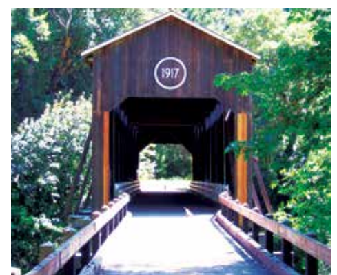
McKee Bridge

The McKee Bridge Historical Society will hold its annual meeting on Saturday, September 10, beginning at noon with a potluck on the bridge, followed by the annual meeting around 12:30 pm. Members and non-members are invited to join us on the recently restored McKee Bridge for a pleasant lunch above the river.