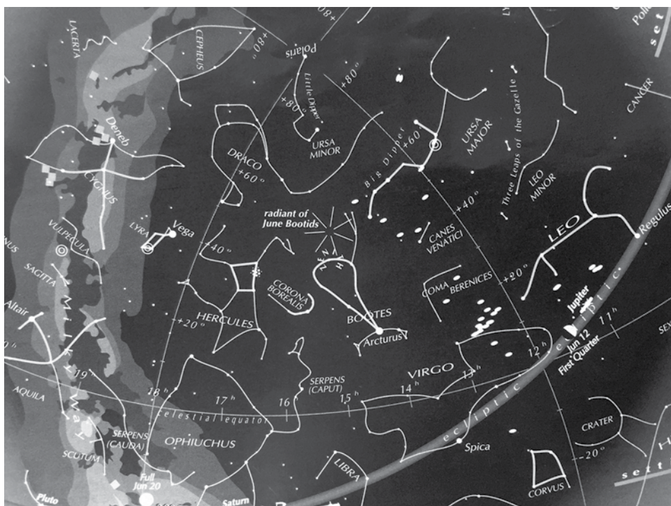
Illustration: Guy Ottewell's Astronomical Calendar 2016.

Have you seen the Gater's ONLINE CALENDAR?