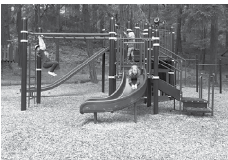
Ruch School sixth graders spread wood chips at the new playground.

Children enjoy the new playground equipment.