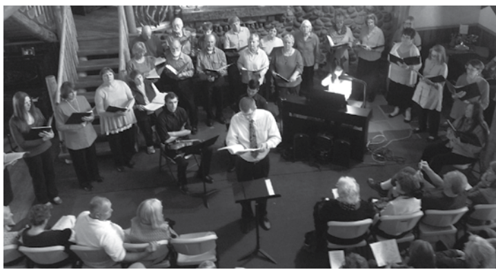
Voices of the Applegate holds concerts twice a year at Applegate River Lodge.