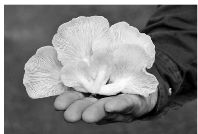
What the heck is this, you ask? Find out at one of the three Siskiyou Field Institute mushroom classes offered this fall.

Find out more about these and other fall Siskiyou Field Institute classes by visiting www.thesfi.org or calling 541-597-8530.