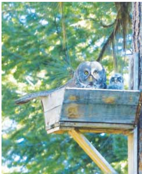
Nesting platform with female Great Gray Owl and her young at Howard Prairie.