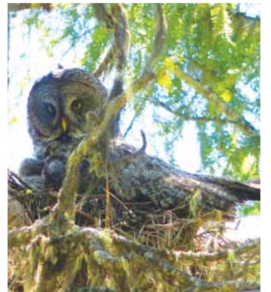
Female Great Gray Owl with two young in raven nest at Willow-Witt.

Please support our advertisers! Shop local; keep our dollars local.