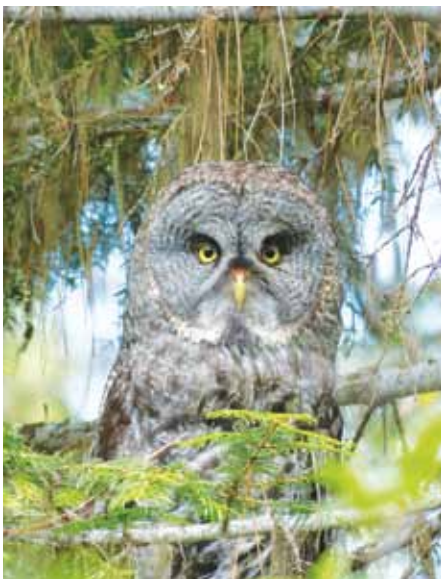
Female Great Gray Owl at Willow-Witt Ranch near Grizzly Peak.