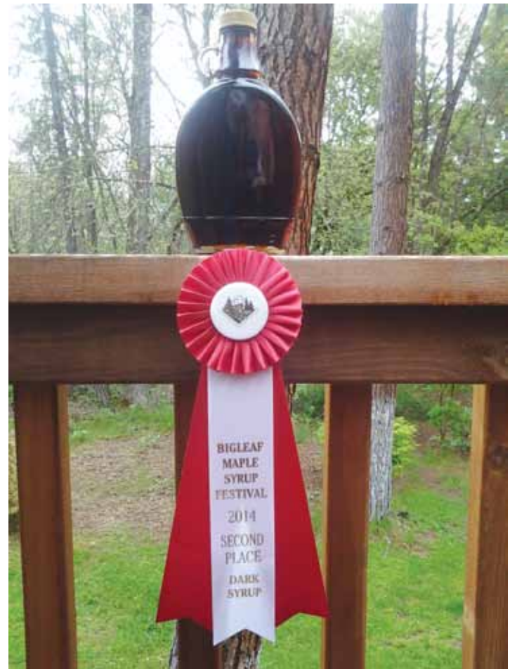
Laird Funk won second place as an “international” competitor in the Bigleaf Maple Syrup Festival held annually on Vancouver Island, British Columbia, Canada.

With Luke doing the saw work and I and a helper acting as the cleanup crew sorting and moving the brush and firewood, we set to work. Things went very smoothly and we made great progress. Because we kept anything over one and a half inches (just the right size for fueling an evaporator), the normally expected amount of brush was greatly reduced, making cleanup much