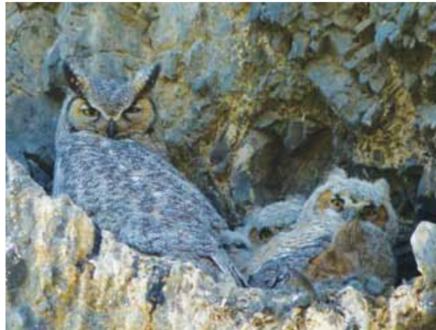
Young Great Horned Owls make loud, persistent hissing or screeching sounds, often confused with those of barn owls.