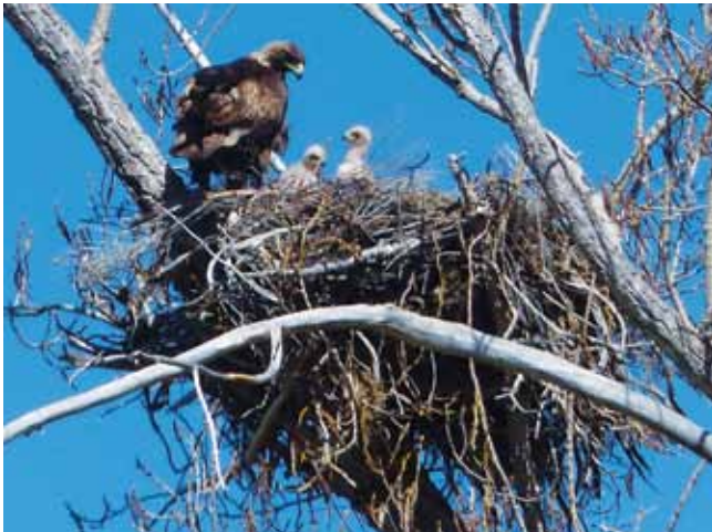
The Golden Eagle uses its agility and speed combined with powerful feet and massive, sharp talons to snatch up its prey.