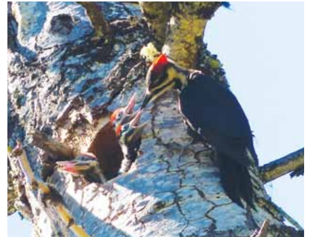
A Pileated Woodpecker pair stays together on its territory all year-round and is a nonmigratory species.