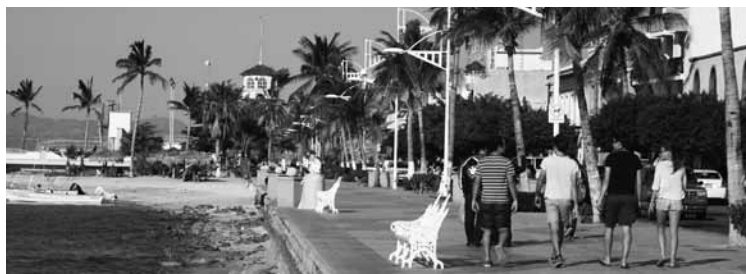
The malecón, an active walkway in La Paz, stretches for several kilometers along the shore.