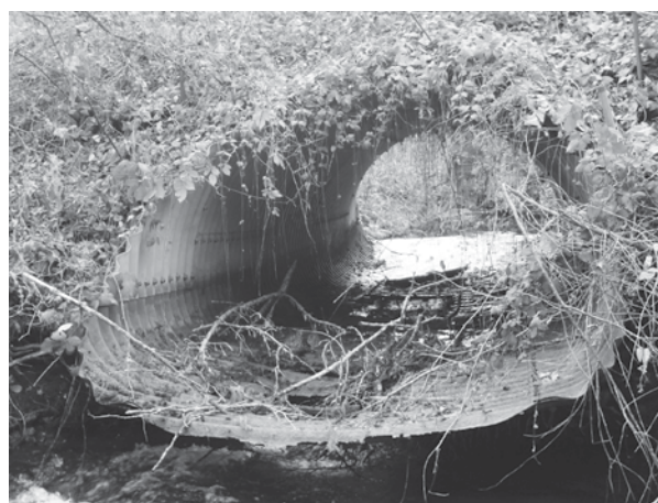
Butcherknife Creek Culvert, a tributary of Slate Creek, is both impassable by salmon and a safety hazard for the landowners crossing it daily.

The Butcherknife Creek culvert is a large, metal arch culvert that provides the main ingress and egress to residents up Butcherknife Creek Road and Onion Mountain Road. The bottom of this