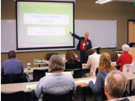
Choose from four 90-minute classroom sessions, plus a catered lunch to chat with the experts.