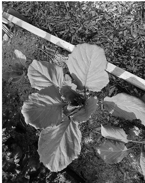
Apparently rice hulls deterred the wee slugs' appetite for leaves, even though plastic cup barriers were not used.

Dirty fingernails and all Sioux Rogers 541-846-7736 mumearth@dishmail.net