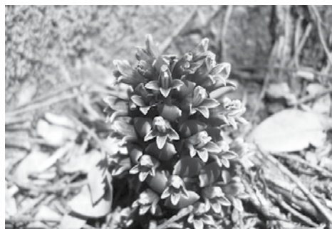
Top photo: Ground cone in flowering state ( http://picasaweb.google.com/ih/photo/-eq5XHDWTer4BisRtats8A ).

This article is reprinted from http://extension.oregonstate.edu/sorec/groundcone .