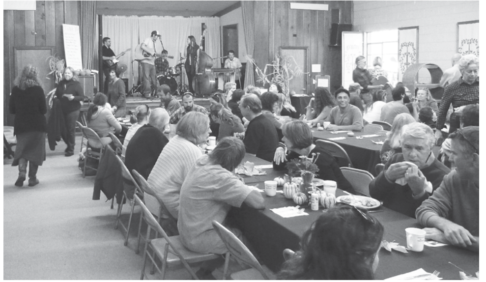
Two-hundred fifty people attended the Applegate Valley Community Grange's first community-wide Harvest Brunch on November 4. The Turner Moore Band entertained.