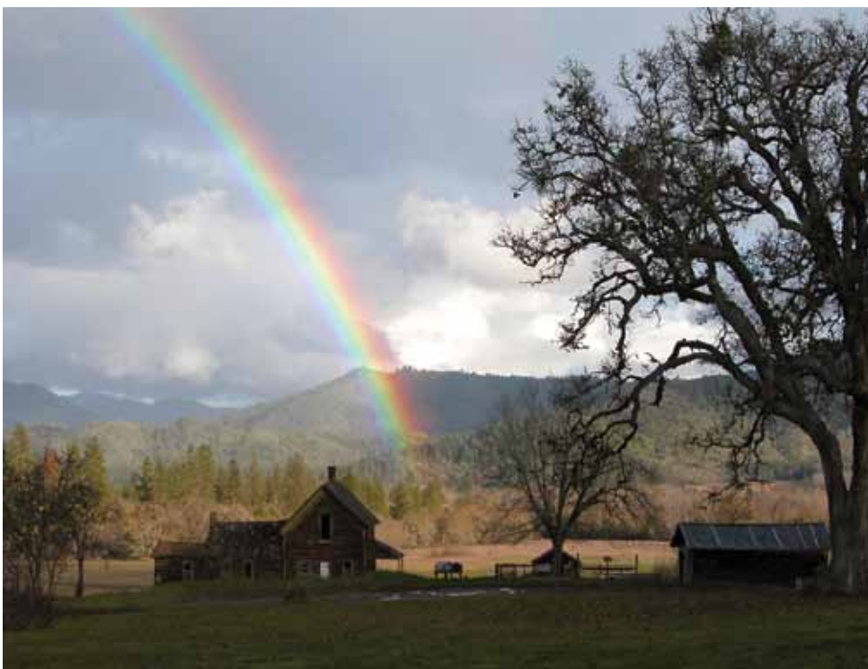
Photo of rainbow taken by Maxie Jarrell on Water Gap Road in Williams, Oregon. The old Topper house was built around 1900.