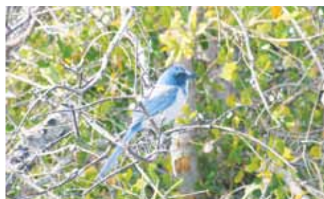
Photos clockwise from top left: Western Scrub Jay, Island Scrub Jay, Florida Scrub Jay, Golden-crowned Sparrow.