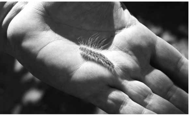
A fall webworm, native to North America, is found across the continent.

web in some landscape trees around the Rogue Valley. At the time, the prevalence of the fall webworm around the valley was considered to be an unusual population spike, curious and notable, but nothing to get alarmed about. Then this summer, the white adult moths appeared in June and July in rather large numbers, followed by the egg masses showing up. I had three grape growers bring in moths or egg masses during a one-week period. Considering how