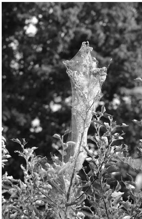
Webworm nest as seen throughout the Rogue Valley.