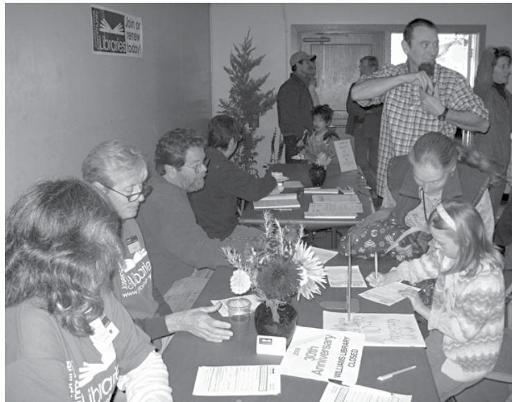
Signing up for library cards.