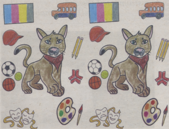
Illustration by Hailey Reeves