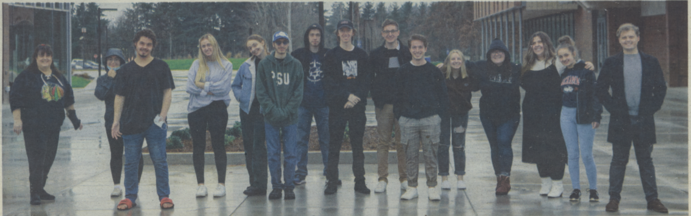
The Clackamas Print staff goals of fall 2021 were to learn something and not spread covid. Mission Accomplished!